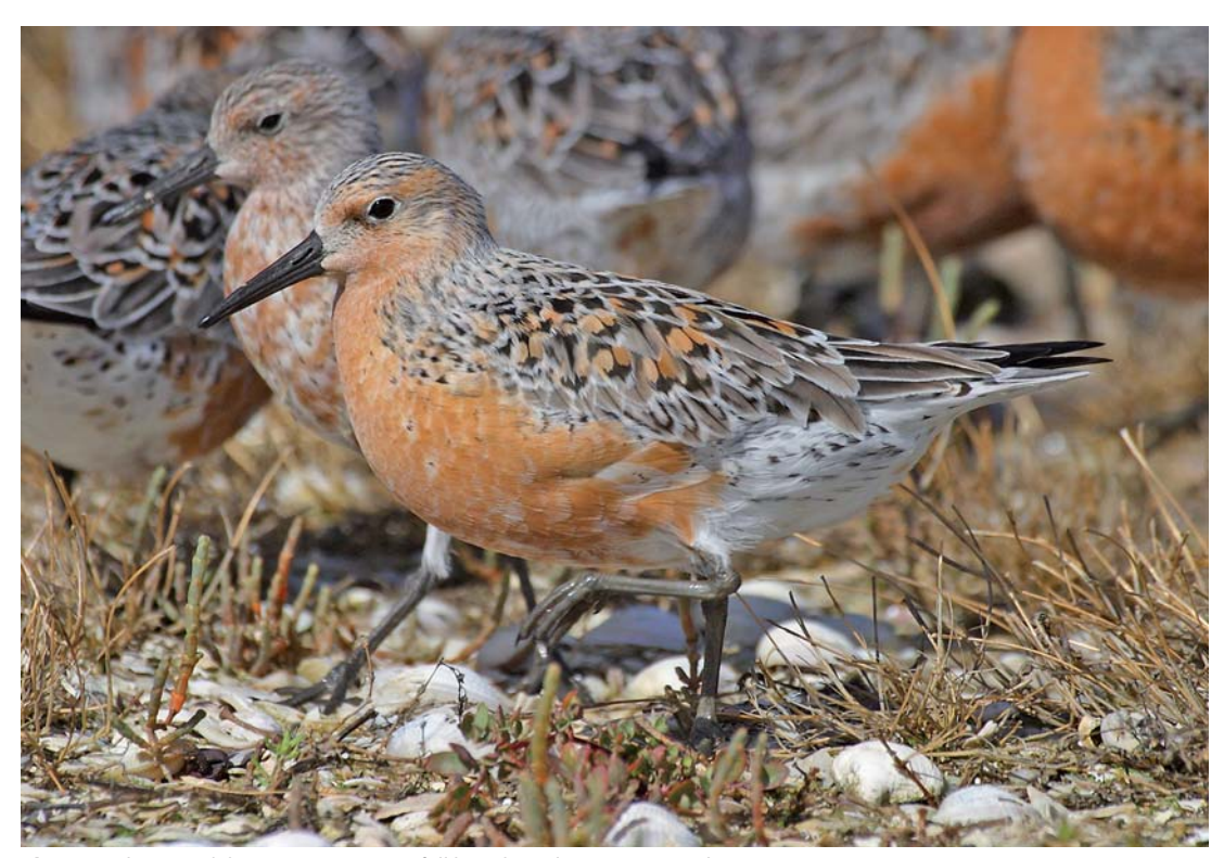
Plate 3 . Red Knot Calidris canutus rogersi in full breeding plumage, 19 March 2007.