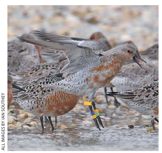
Plate 1. Colour flagged Red Knot Calidris canutus, 9 April

EAAF between early March and late September. The information we need is the colour and position of the flag(s) on birds' legs (including flag position on birds with four colour-bands) along with the date and location. We are also very interested to receive any old records that have not been reported to date. We are trying to find the location and relative importance of any other staging sites in the EAAF. Some earlier work suggested that subspecies piersmai makes a direct flight from north-west Australia to Bohai Bay (Battley et al. 2005) but our recent 2011 work suggests that this is not the case. No individually marked Red Knot was seen for 25 days after it was last reported at Roebuck Bay and next reported in Bohai Bay (GFN unpublished data)—a Red Knot travelling at about 50-55 km/hr in reasonable weather conditions on a direct line would take just over five days to cover the 6,400 km distance. Did severe weather make