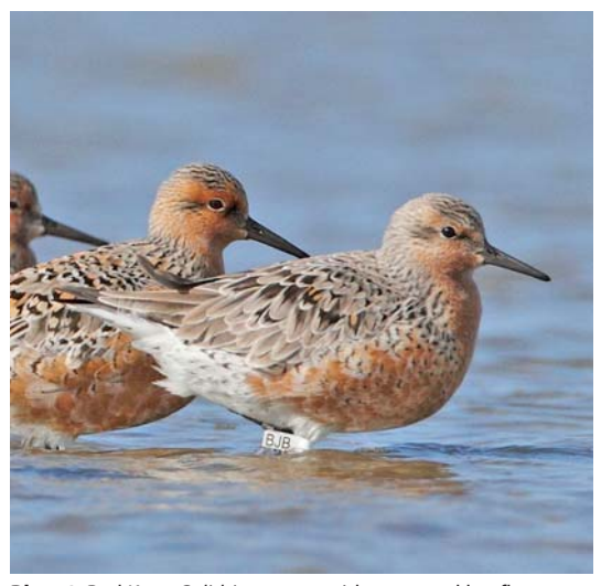
Plate 2 . Red Knot Calidris canutus with engraved leg flag, 29 March 2010.

EAAF between early March and late September. The information we need is the colour and position of the flag(s) on birds' legs (including flag position on birds with four colour-bands) along with the date and location. We are also very interested to receive any old records that have not been reported to date. We are trying to find the location and relative importance of any other staging sites in the EAAF. Some earlier work suggested that subspecies piersmai makes a direct flight from north-west Australia to Bohai Bay (Battley et al. 2005) but our recent 2011 work suggests that this is not the case. No individually marked Red Knot was seen for 25 days after it was last reported at Roebuck Bay and next reported in Bohai Bay (GFN unpublished data)—a Red Knot travelling at about 50-55 km/hr in reasonable weather conditions on a direct line would take just over five days to cover the 6,400 km distance. Did severe weather make