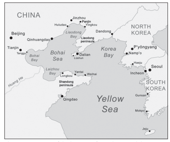
Figure 1 . Location of the key areas for Red Knot Calidris canutus , Bohai Bay and Liaodong Bay.

Alongside HYY's work, studies by GFN have continued during the northward migration in 2009, 2010 and 2011, including intensive searches for individually marked birds of our main study species Red and Great Knot C. tenuirostris , Bar-tailed Godwit Limosa lapponica and Black-tailed Godwit L. limosa , and recording the proportions of rogersi and piersmai subspecies in the flocks of Red Knot. These field studies have been remarkably successful and, in view of the many human-related threats to what is the single most important staging area for the two races of Red Knot that make up the entire population of the species wintering in