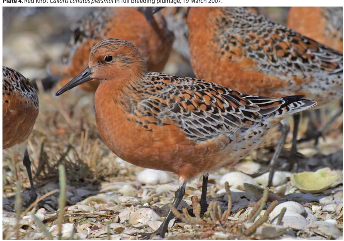
Plate 4. Red Knot Calidris canutus piersmai in full breeding plumage, 19 March 2007.